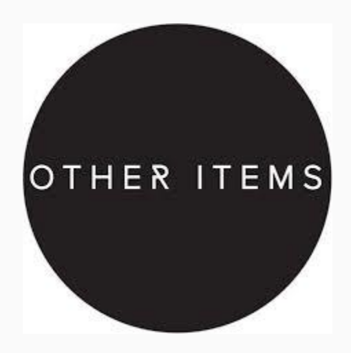
2 Life Issues events

Godalming Baptist Church is hosting 2 events focusing on different life issues. Further details of each event will be included as we get closer to them, but if you would like more information before then, please speak to Faith. For more details on any of the courses, or to make a reservation, please contact: Sally Pollard <a href="mailto:pollard3@hotmail.co.uk">pollard3@hotmail.co.uk</a> / 01483