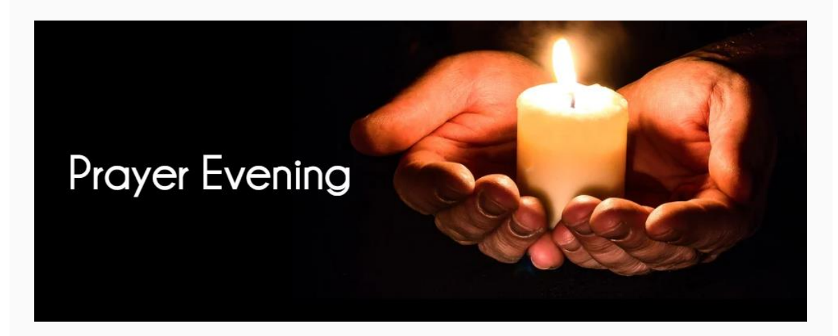
Prayer & Praise Evening

Wednesday 27th March - 10am until 12pm - Renew Wellbeing